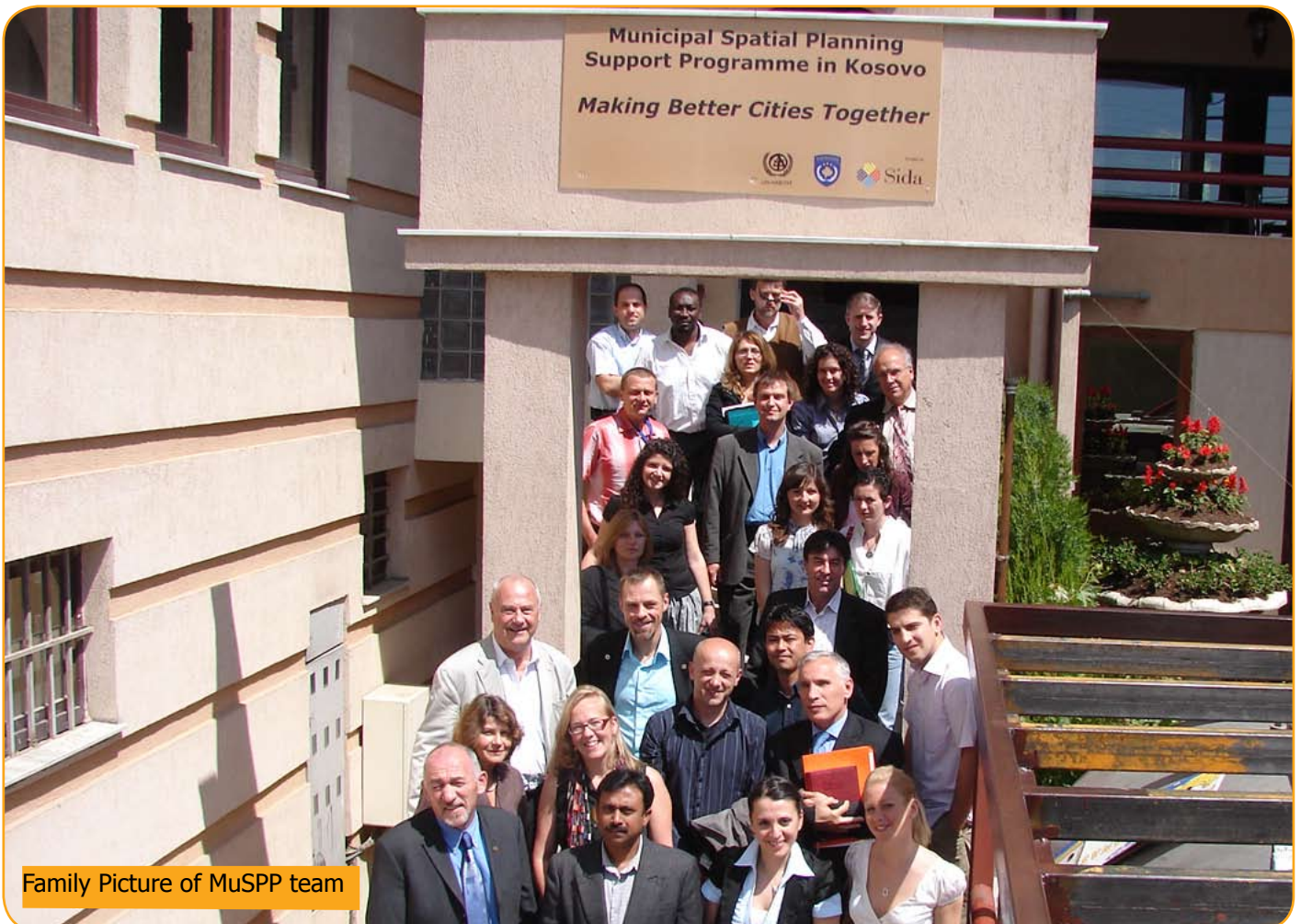
Family Picture of MuSPP team

The site visit of the city, the presentation of the state of play of planning in Prizren by municipal planners and inter-active discussions made it clear that Prizren leaders and professionals are committed to make the planning process work better in Prizren.